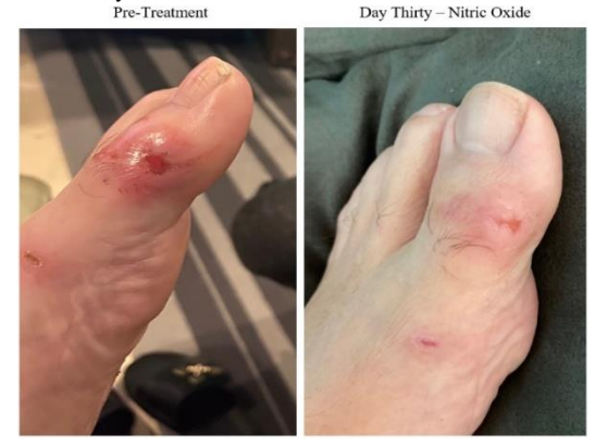
Figure 7: 46-year-old diabetic male, non-healing foot ulcer. Reepithelialization 30 days post NO serum.