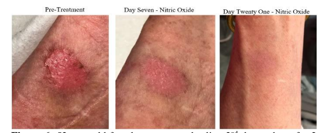
Figure 6: 52-year-old female, status non-healing 2<sup>nd</sup>-degree burn for 2 months. Re-epithelialization after 7 days of NO serum. Marked healing after 21 days of NO serum.

The anti-inflammatory and accelerated keratinization effects of the nitric oxide generating serum were demonstrated in the acne and acne-scarred patient population [16]. This study also demonstrated the safety of applying the NO serum on open wounds, yielding added anti-bacterial