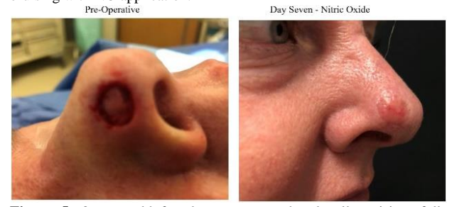
Figure 5: 36-year-old female, status post basal cell excision, fullthickness skin graft reconstruction. At 7 days post-op, neovascularization in healthy flap visualized.