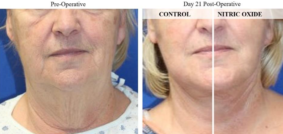
Figure 2: 67-year-old female 21 days post Rhytidectomy shows reduced edema, accelerated healing on NO serum side compared to placebo control.