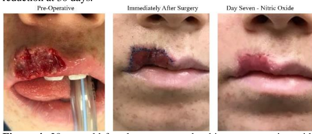
Figure 4: 28-year-old female status post dog bite reconstruction with local flaps. Marked improvement in vascularity, reduced edema, and bruising with NO application.