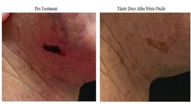
Figure 3: 66-year-old female, smoking-induced ulcer post-Rhytidectomy. Re-epithelialization at 7 days, ongoing healing and scar reduction at 30 days.